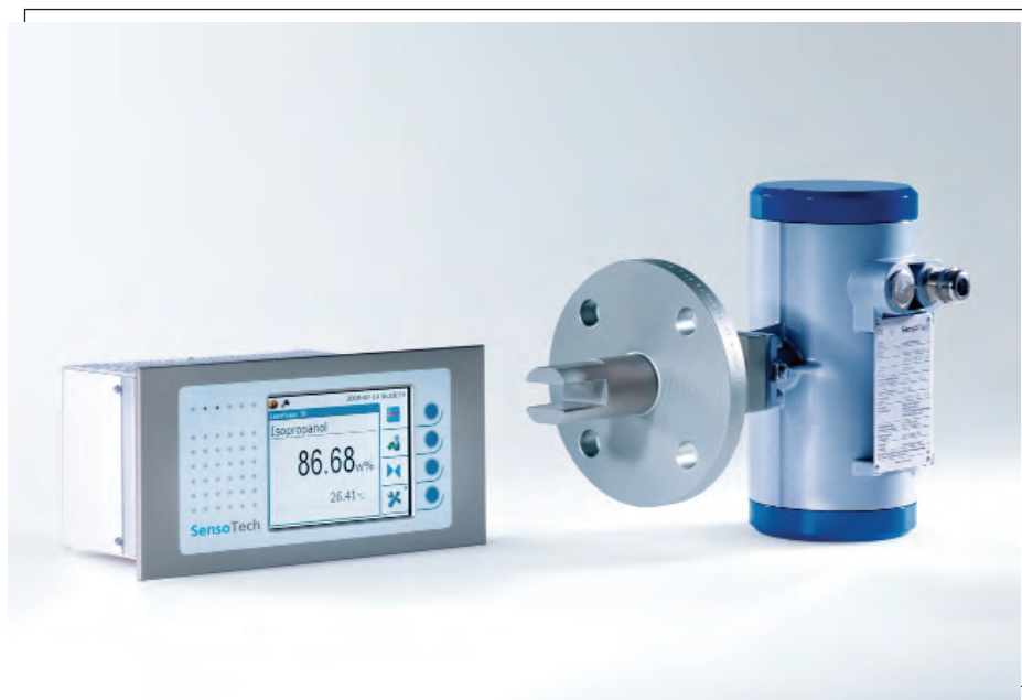
Figure 1: Variants of LiquiSonic® sensors

For optimisation of product quality, production efforts and plant safety nowadays chemical processes are monitored by analytical inline and online technology. Advantages over conventional manual analytical methods include continuous measurement, real-time data output and omission of time-consuming lab analysis. Therefore, the chemical group Lanxess decided on an automatic process control of its plants by using the LiquiSonic® concentration analyser.