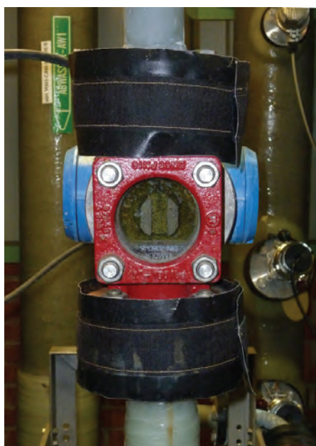
Figure 3: The installed LiquiSonic® immersion type sensor measures the concentration reliably and precisely over years in a plant of the company Lanxess

The measuring principle is based on a runtime measurement, with which the signal velocity is detected. Depending on the material characteristics, there will be a change in the signal respective sonic velocity.