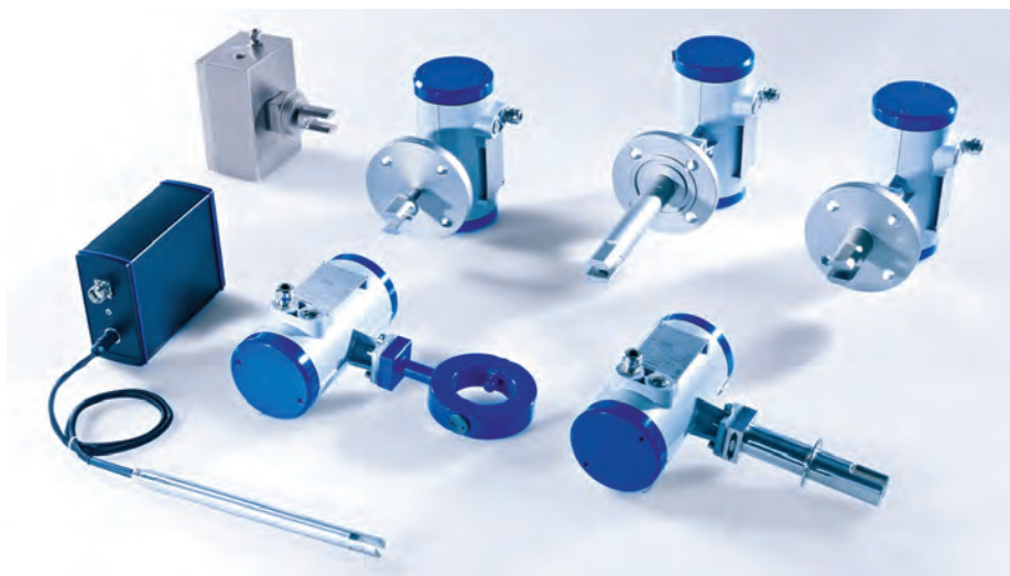
Figure 2: Immersion type sensor and controller of a LiquiSonic® analyser

In order to realise a concentration monitoring, there are different measuring methods available, which vary in their suitability and user-friendliness. Table 1 gives an overview about typical application specifications. As most measuring methods are restricted to operation temperature or pressure, the sonic velocity is able to withstand tough conditions. The sonic velocity measurement convinces beside the conductivity, also regarding lifetime that can be achieved.