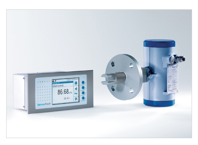
LiquiSonic® controller and immersion type sensor

The liquid-wetted sensor parts are made of HC2000.