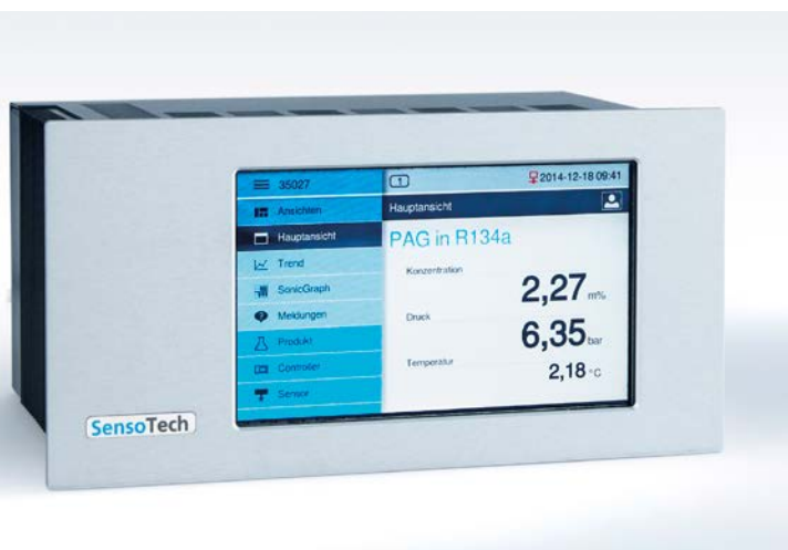
LiquiSonic® Controller 30

The event log records states and configurations such as manual product switches, alarm messages or system states.