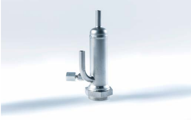
Flow adapter for refrigerant applications

For an easy integration of the sensor into the process, the flow adapter is ideal and available in various designs. The inlet and outlet are a standard tube with 12mm diameter (OD), which can be assembled with suitable fittings. In addition, the adapter provides the integration of a pressure sensor.