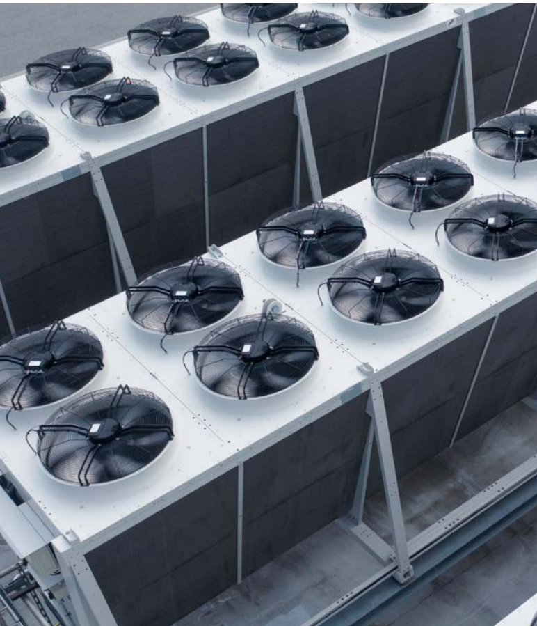
Cooling system of a large warehouse on the roof