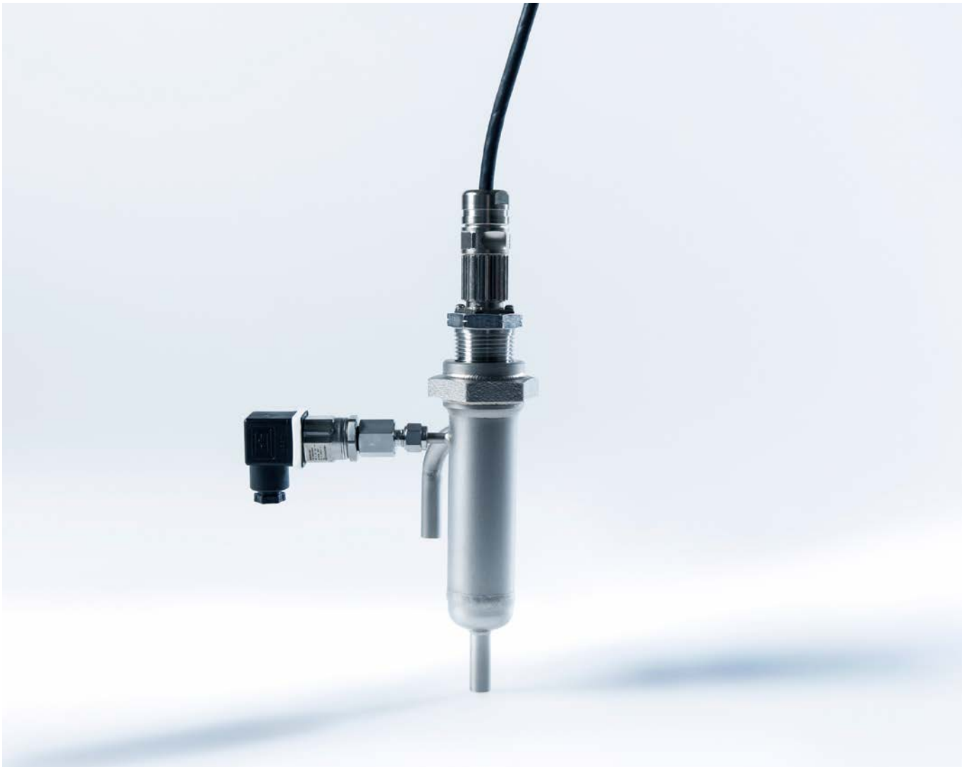
LiquiSonic® system structure - ultrasonic sensor and pressure transmitter integrated in the flow adapter