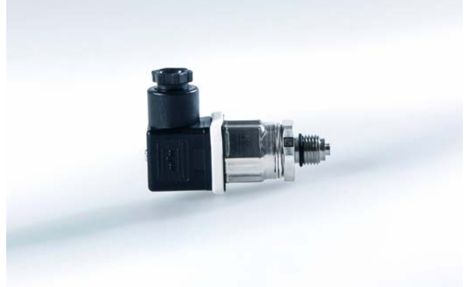
Pressure transmitter for refrigerant applications

To determine the pressure compensated concentration, the LiquiSonic® analyzer includes a pressure sensor. The pressure is fed and set off by an analog signal of 4...20mA in the controller.