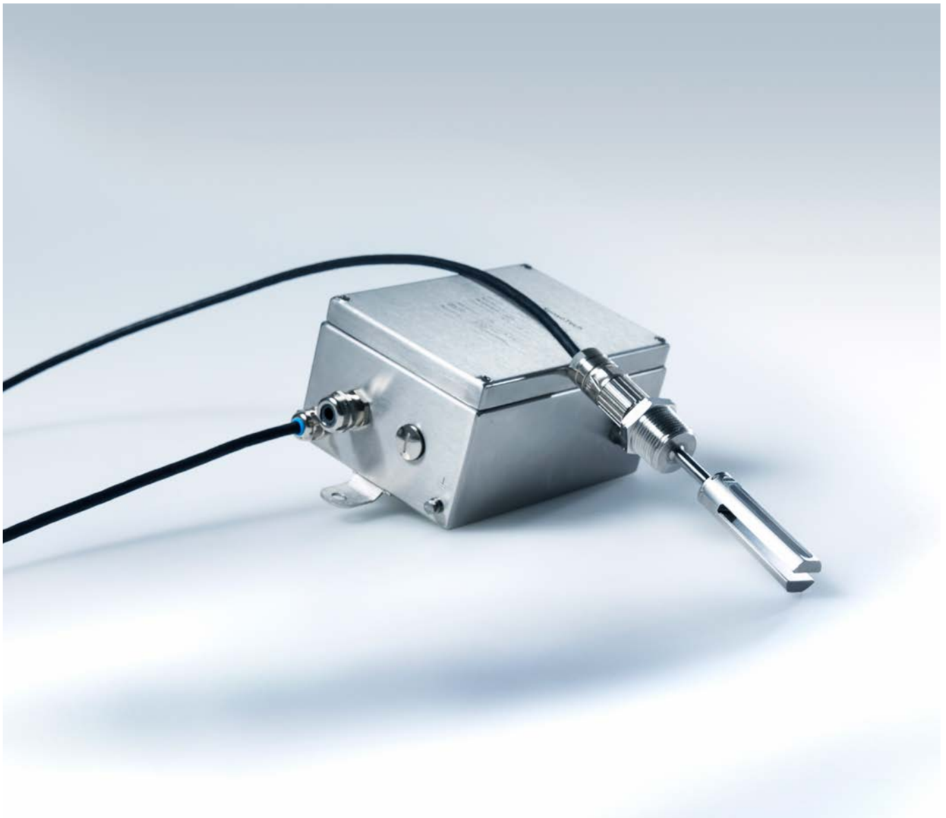
LiquiSonic® immersion sensor for oil/refrigerant mixtures

The system is designed to integrate seamlessly with process control systems, transmitting and adjusting pressure readings via an analog signal in the 4...20mA range, ensuring precise and responsive process control.